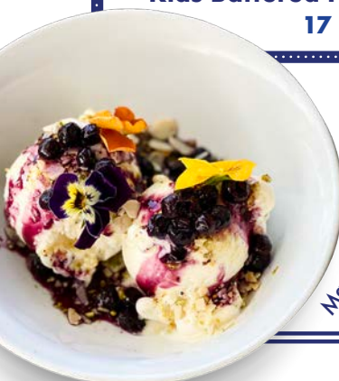
Mastiha Ice Cream