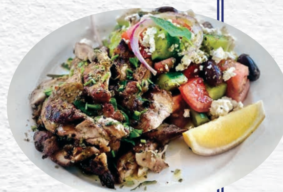
Spit Meat and Greek Salad