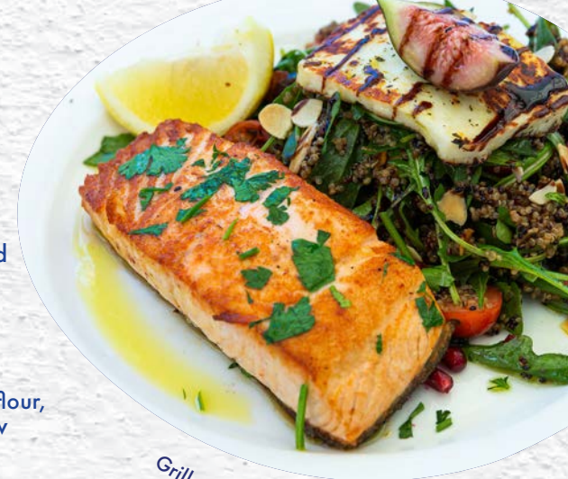
Grilled Salmon and Haloumi Salad

Homemade Galaktopoureko semolina custard cream baked in filo pastry drizzled with kazzi syrup