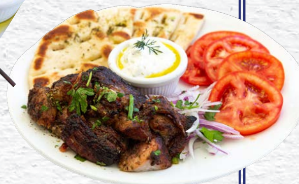
Spit Meat & Pitta

Stix & Chips 28 2 stix (your choice of chicken or lamb) served w chips and tzatziki (extra stix 5 each)