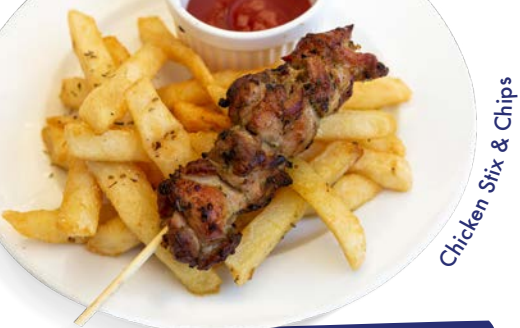
Chicken Stix & Chips