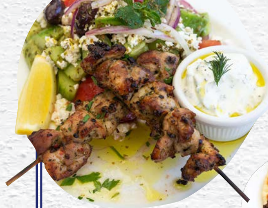
Chicken Stix & Salad