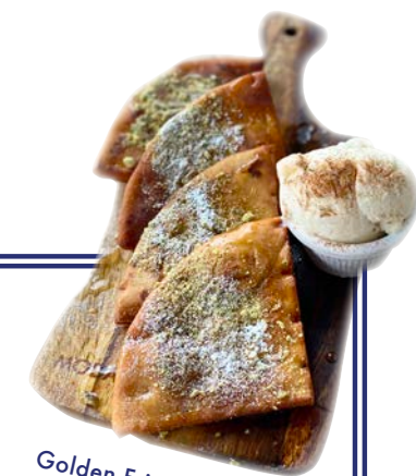
Golden Fried Pitta Bread