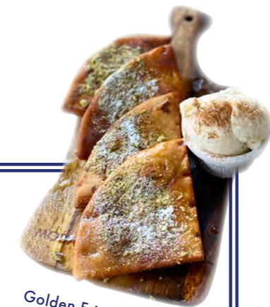
Golden Fried Pitta Bread