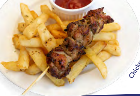
Chicken Stix & Chips