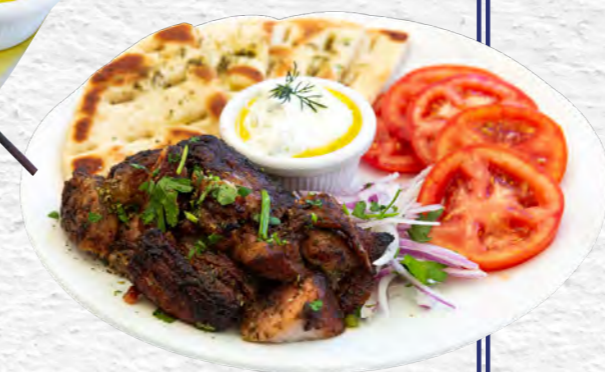
Spit Meat & Pitta

Stix & Chips 28 2 stix (your choice of chicken or lamb) served w chips and tzatziki extra stix 7.5 each (only as addition to main meal)