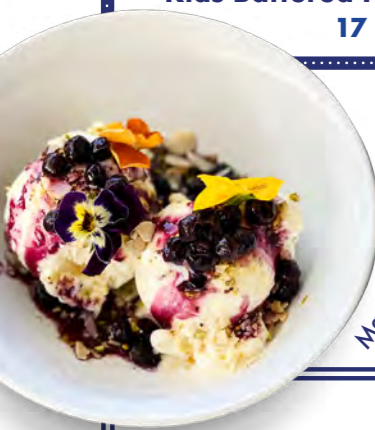
Mastiha Ice Cream