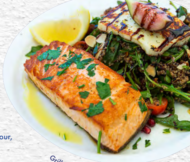
Grilled Salmon and Haloumi Salad

Homemade Galaktopoureko semolina custard cream baked in fillo pastry drizzled with kazzi syrup