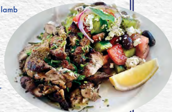
Spit Meat and Greek Salad