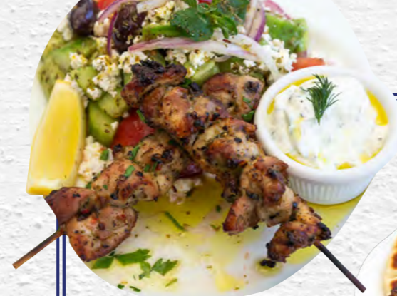
Chicken Stix & Salad