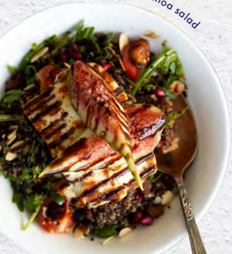
Halloumi, fig & quinoa salad

Black Eyed Bean Salad 16 / 19.5 black eyed beans, cherry tomatoes, cucumber, onion, red capsicum, parsley, coriander, lemon and olive oil dressing, served w toasted sourdough drenched in salt, pepper, lemon and olive oil (gfo) (veg)